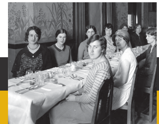
Students dining in Morrill Hall— 1930s